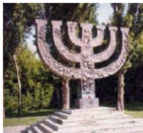
Babi Yar Holocaust Memorial